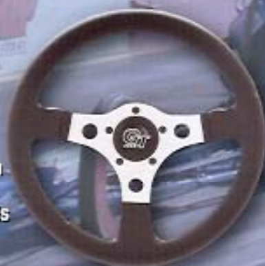
763 Formula GT Model. Silver spokes with 3" dish.