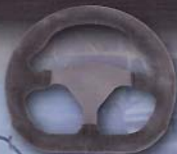
613-4 Black suede anodized spokes. Mounting holes must be drilled. NOT FOR STREET USE.