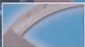
642 Back of Rim