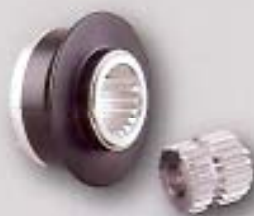
3001 "Pinless" For GM splined shaft 3002 For Ford splined shaft 3003 To weld on 5/8" shaft 3004 To weld on 3/4" shaft

All "Pinless" quick release models meet the S.F.I. 42.1 specification. This is a NHRA mandatory specification. The 3001 and 3011 series fit Grant 3-bolt pattern wheels. The 3021 series fit Grant 5-bolt pattern wheels.