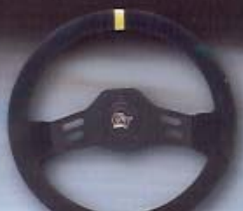
614 Suede Top Marker Model. Features yellow top marker. 13 1/4" diameter, 3 1/4" dish including styling sleeve.