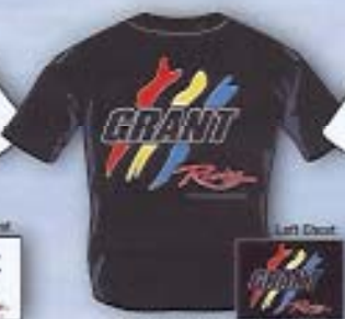
016 Grant Racing