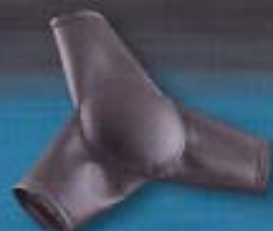
4035 Center Pad Smaller pad features velcro attachment. A 3" diameter center with spoke covers.