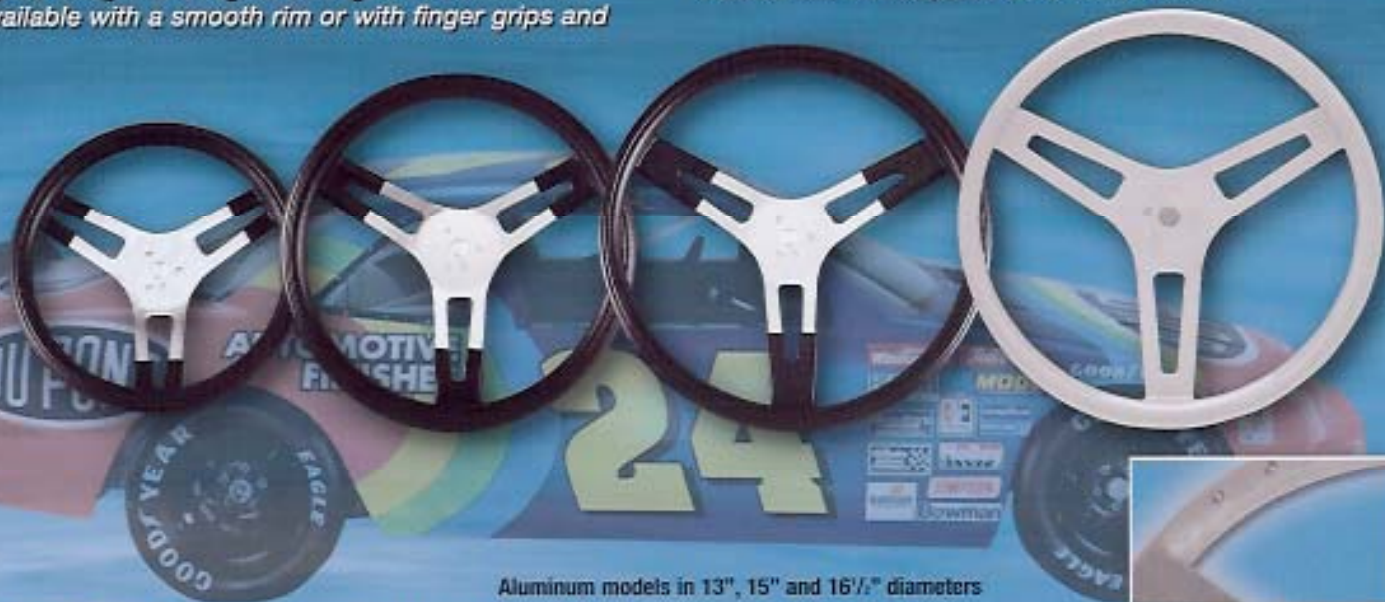
Aluminum models in 13", 15" and 16 1/2" diameters

have an extra thick textured foam cushion grip for comfort (Except #640, #641, #642). All wheels have Grant's standard hole mounting pattern. Aluminum wheels are not shipped with horn button.