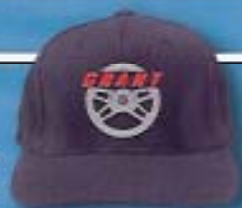
063 Black Logo Cap

The Grant Caps feature embroidered logos.