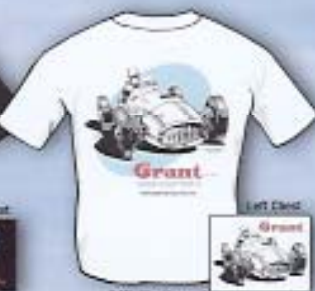
042 Heritage 1