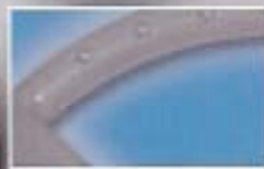
685 Back of Rim