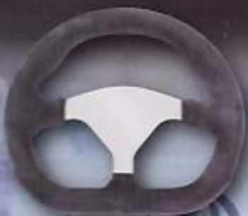
713-4 Black anodized spokes. Mounting holes must be drilled. NOT FOR STREET USE.