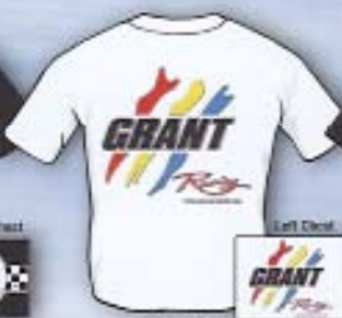
015 Grant Racing