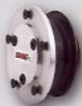
3021 "Pinless" For GM splined shaft 3022 For Ford splined shaft 3023 To weld on 5/8" shaft 3024 To weld on 3/4" shaft 3027 For Honda splined shaft