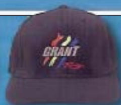
071 Black Splash! Logo Cap

Grant offers a line of high quality tee shirts imprinted with the Grant logo and the Grant Racing logo.