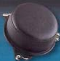
4025 Center Pad Large pad features straps with metal snaps for secure fit, 5" diameter.