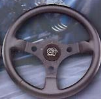
773 Formula GT Model. Black spokes with 3" dish.