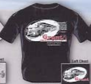
046 Heritage 5