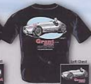
047 Heritage 6