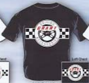
014 Grant Logo