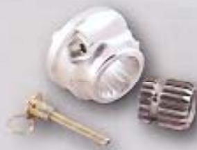
3011 "Pin" For GM splined shaft 3012 For Ford splined shaft 3013 To weld on 5/8" shaft