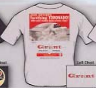
044 Heritage 3