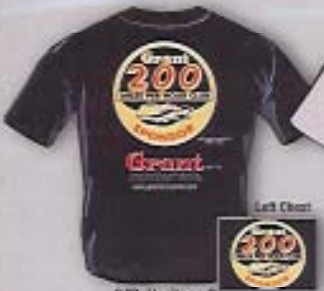
043 Heritage 2