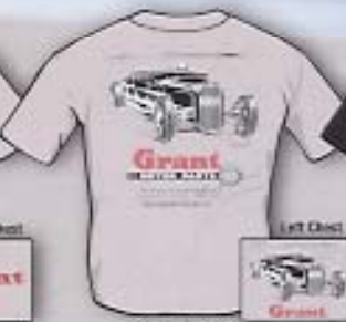
045 Heritage 4