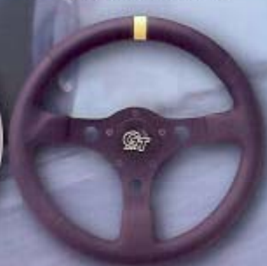
1075 Pro Stock Model. The grip is a combination of diamond textured and smooth vinyl with a yellow top marker. 3" dish.