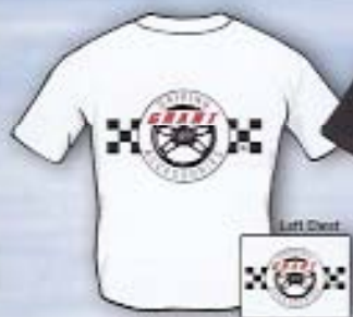
013 Grant Logo

The shirts are 100% pre-shrunk cotton and available in adult sizes M, L, XL and XXL.