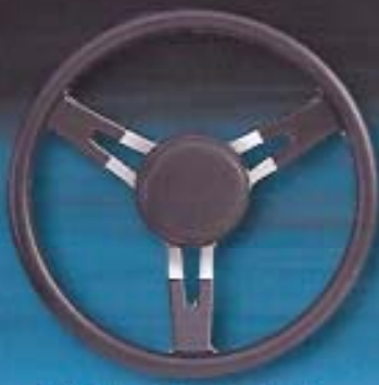
4025 Center Pad on wheel

These vinyl-covered center pads are designed for use with Grant 3-spoke Performance Series steering wheels. Designed to be easy to install and to remain securely in place.